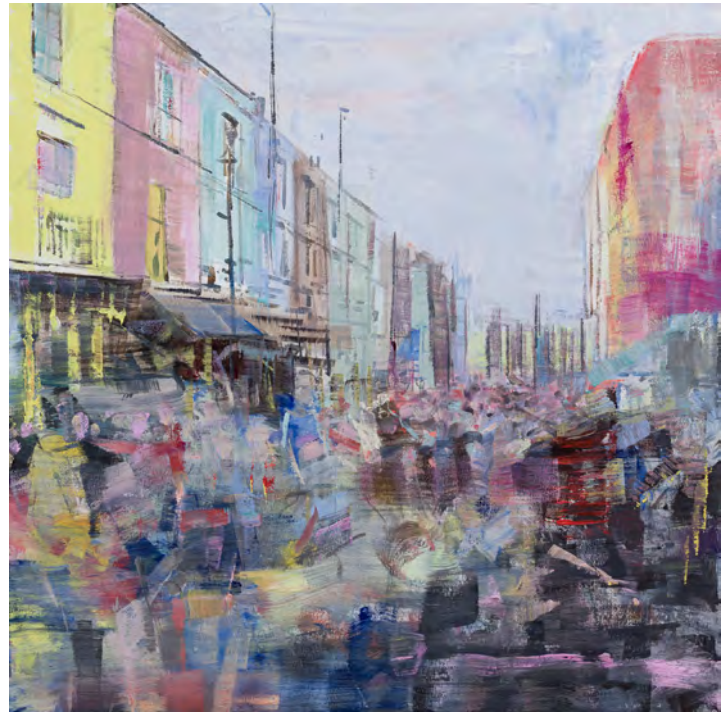
Oona Hassim, Portobello pre Covid, 2020 Acrylic and oil on canvas, 61 x 61 cm

Notes to Editors: Exhibition Dates: 16 September - 2 October 2020 Private View: Wednesday 16 September by appointment.