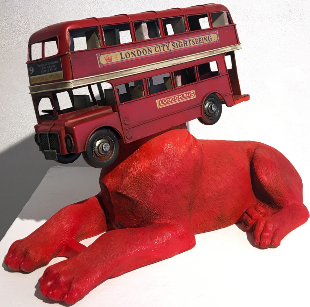
FINN STONE 'THE BUS TO BARKING', Mixed Media 40 x 28 x 20cm 2019