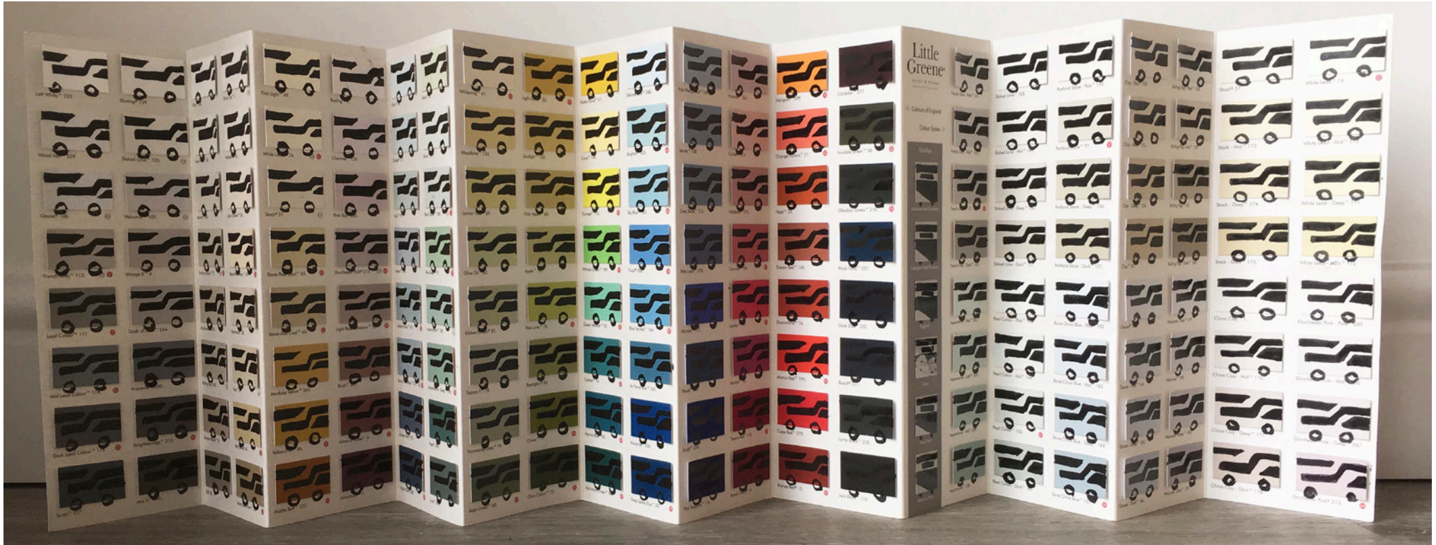
JOANNE TINKER 'BUS TICKET COLOURCHART', Mixed media 100 x 24cm 2019