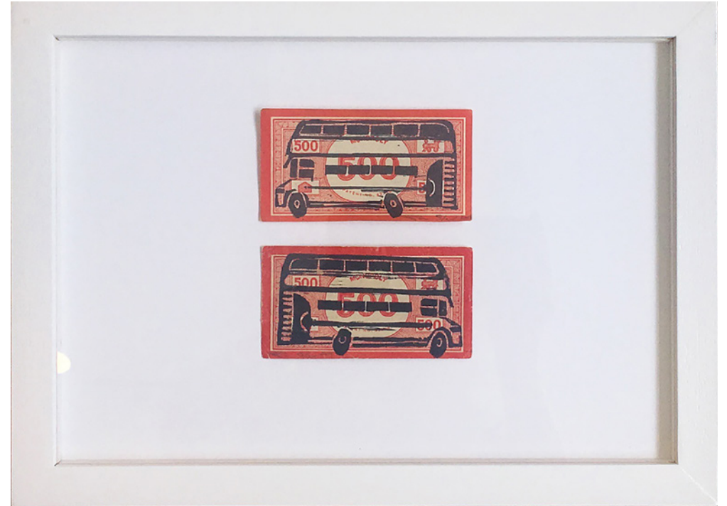
PAM GLEW, MAGIC MONEY TREE, Lino on vintage Monopoly money in white frame, 28 x 21cm 2019

Monopoly money prints are available to order unframed £50 for a pair (one going left, one going right). Or £25 unframed for one bus. (or they can be framed as above).