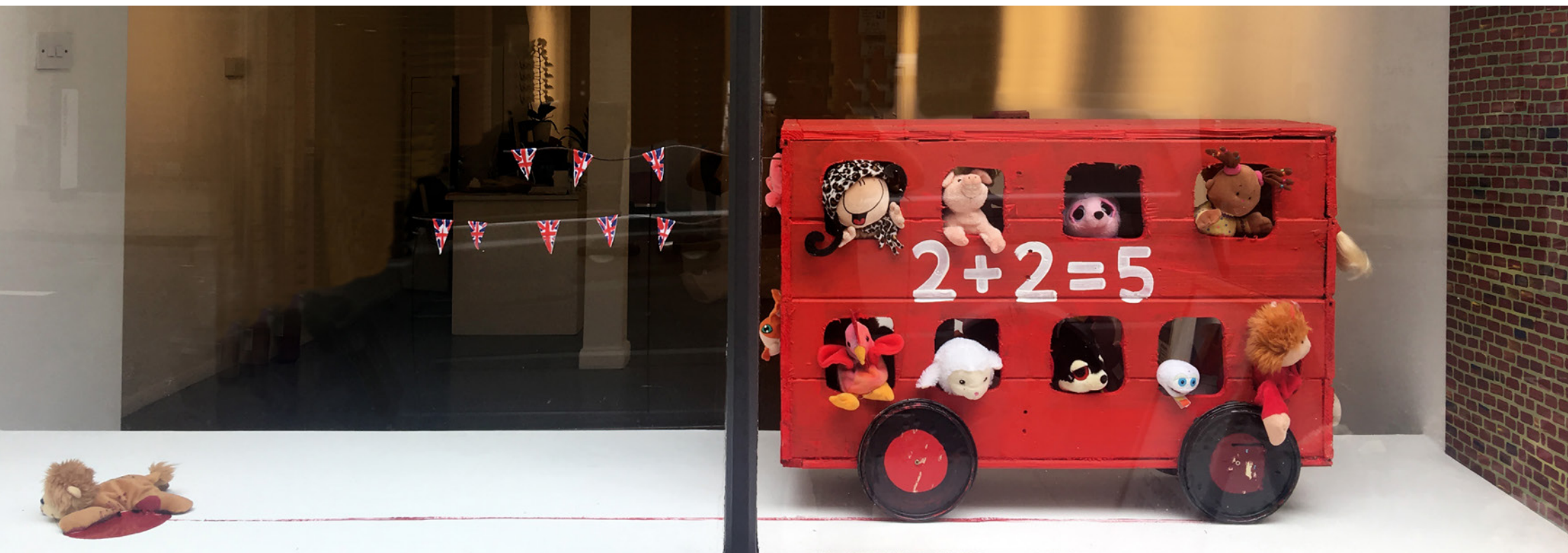
RUSSELL WEST, 'BUMBLE ON...', Mixed media 215 x 80 x 47cm 2019