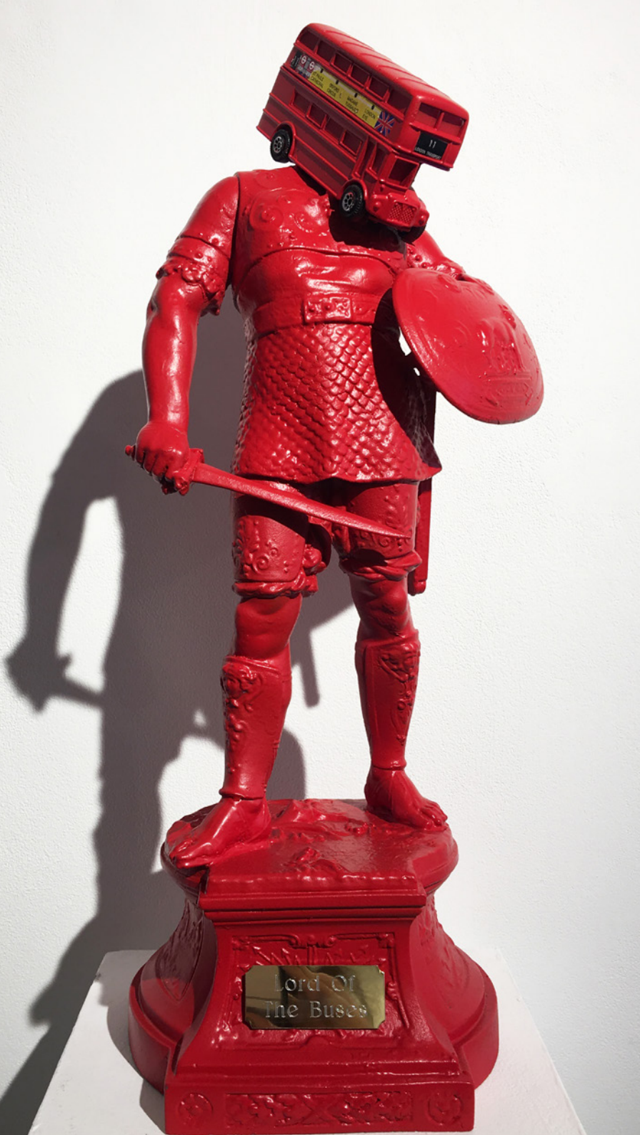
FINN STONE LORD OF THE BUSES Mixed media 50 x 18 x 15cm 2019