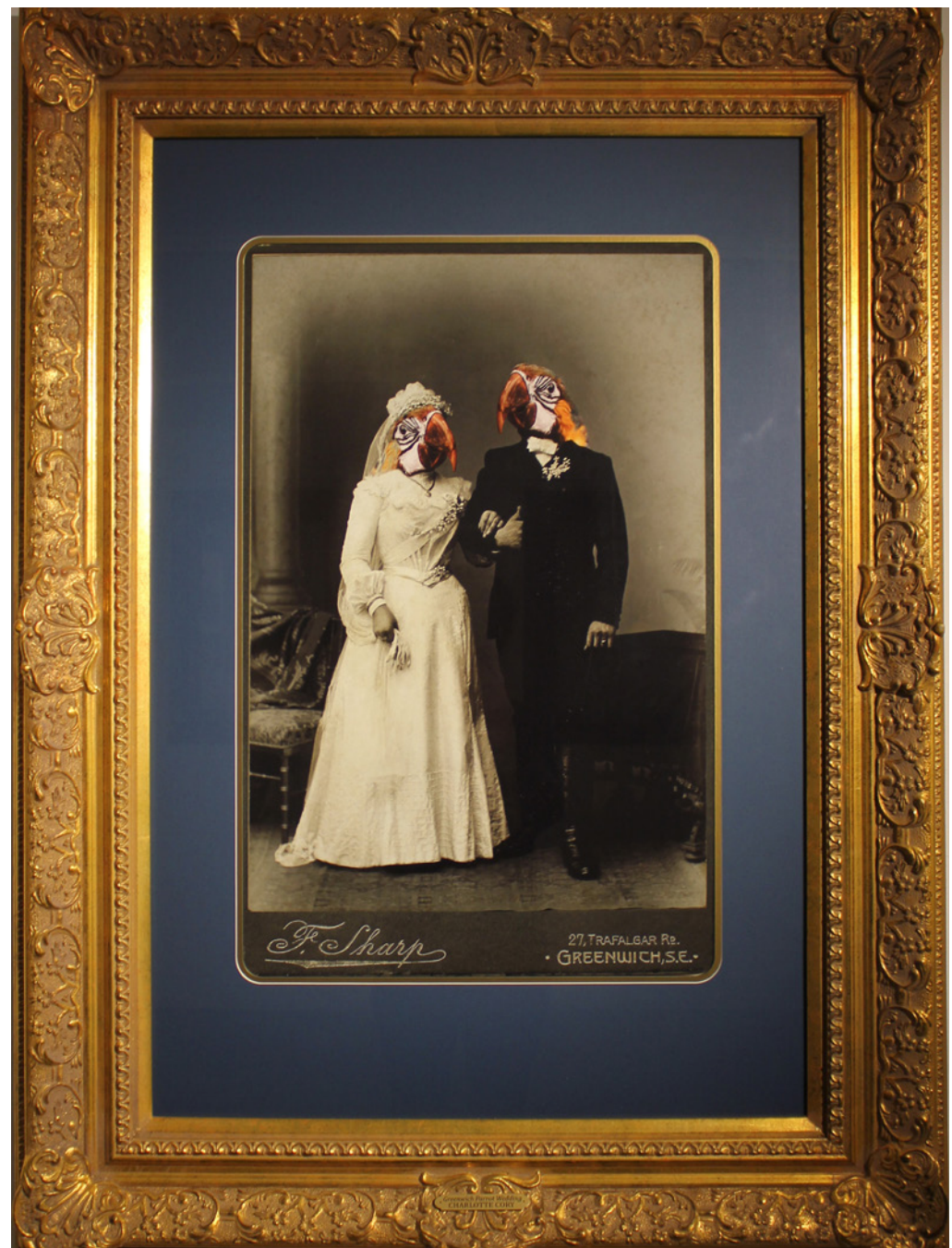
Charlotte Cory, Parrot Wedding Photomelange in large gold frame 84 x 115cm