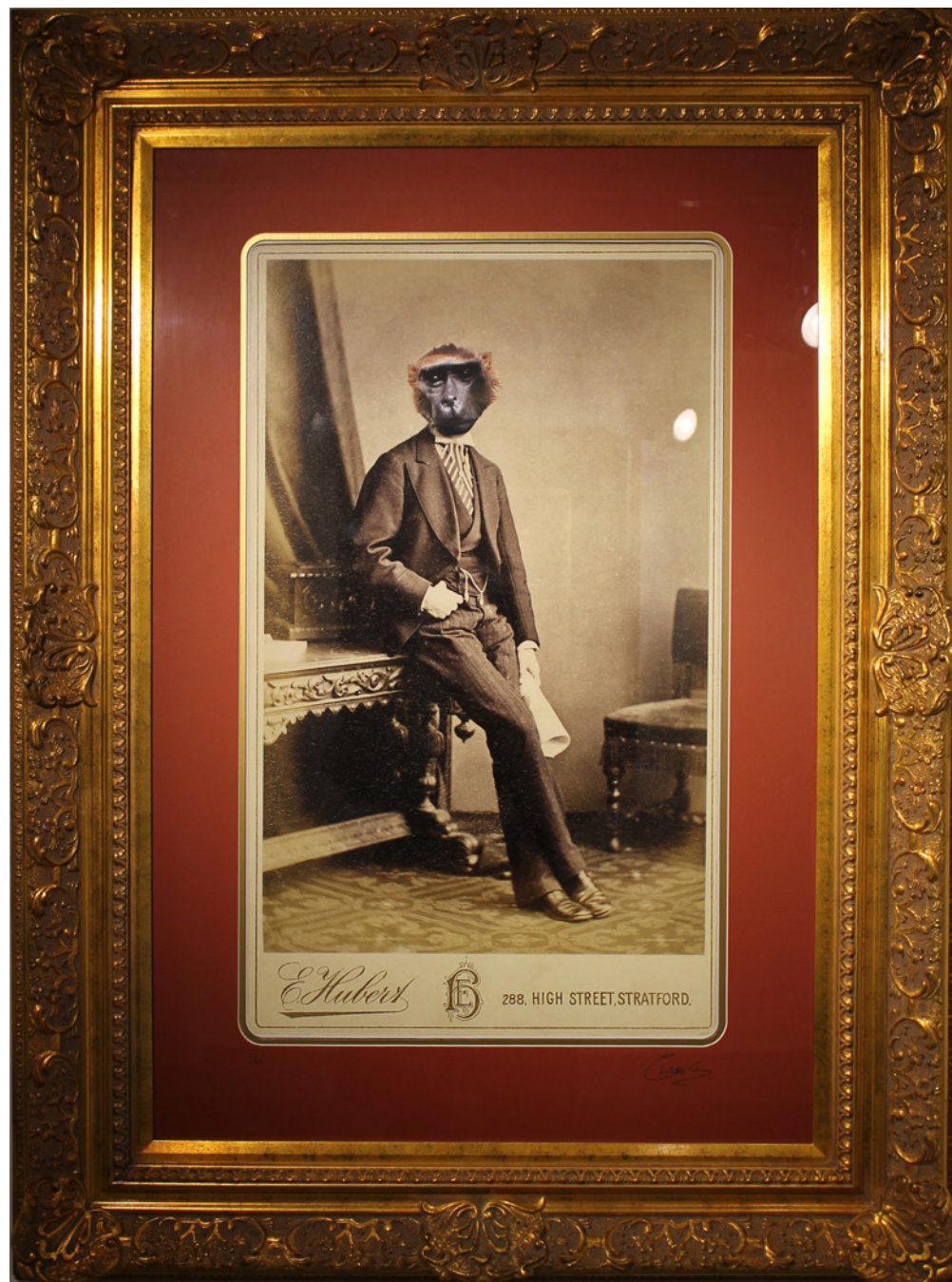
Charlotte Cory , William Shakespeare, 84 x 115cm, edition of 10, Photomelange with antique style Gold frame (Opposite page - artwork illustrated inside frame)