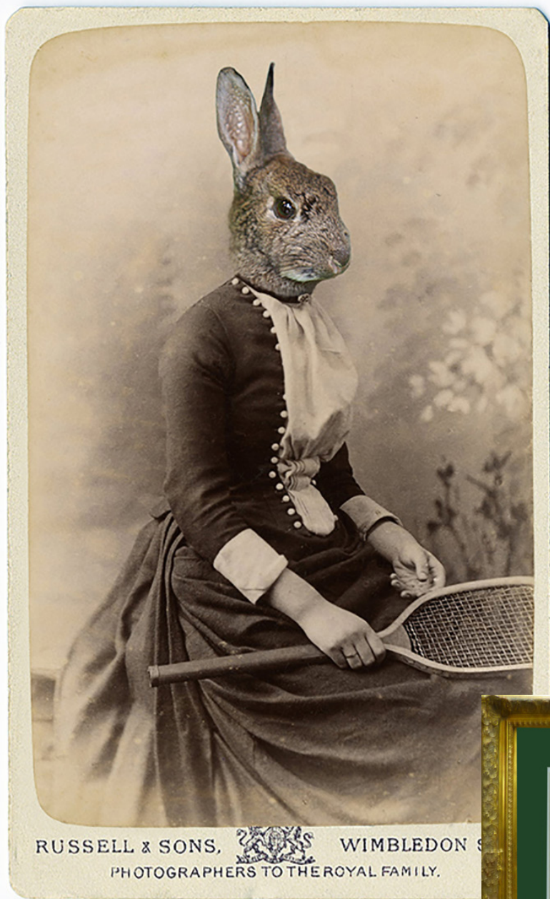
Charlotte Cory, Anyone for Tennis? Photomelange in large gold frame 74 x 102cm