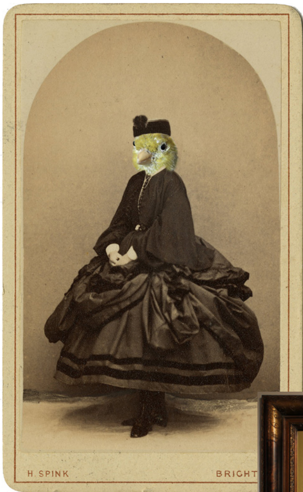
Charlotte Cory, The Favorite , 84 x 115cm, edition of 3, Photomelange with antique style bronzed frame