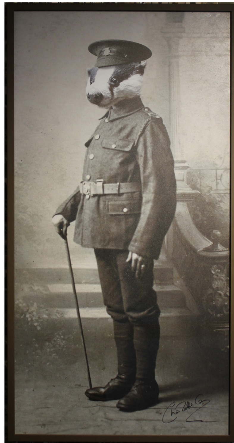
Charlotte Cory, Soldat 3, 104 x 54, Unique piece Photomelange print on metal

T: +44 (0) 207 631 0551 www.woolffgallery.co.uk info@woolffgallery.co.uk