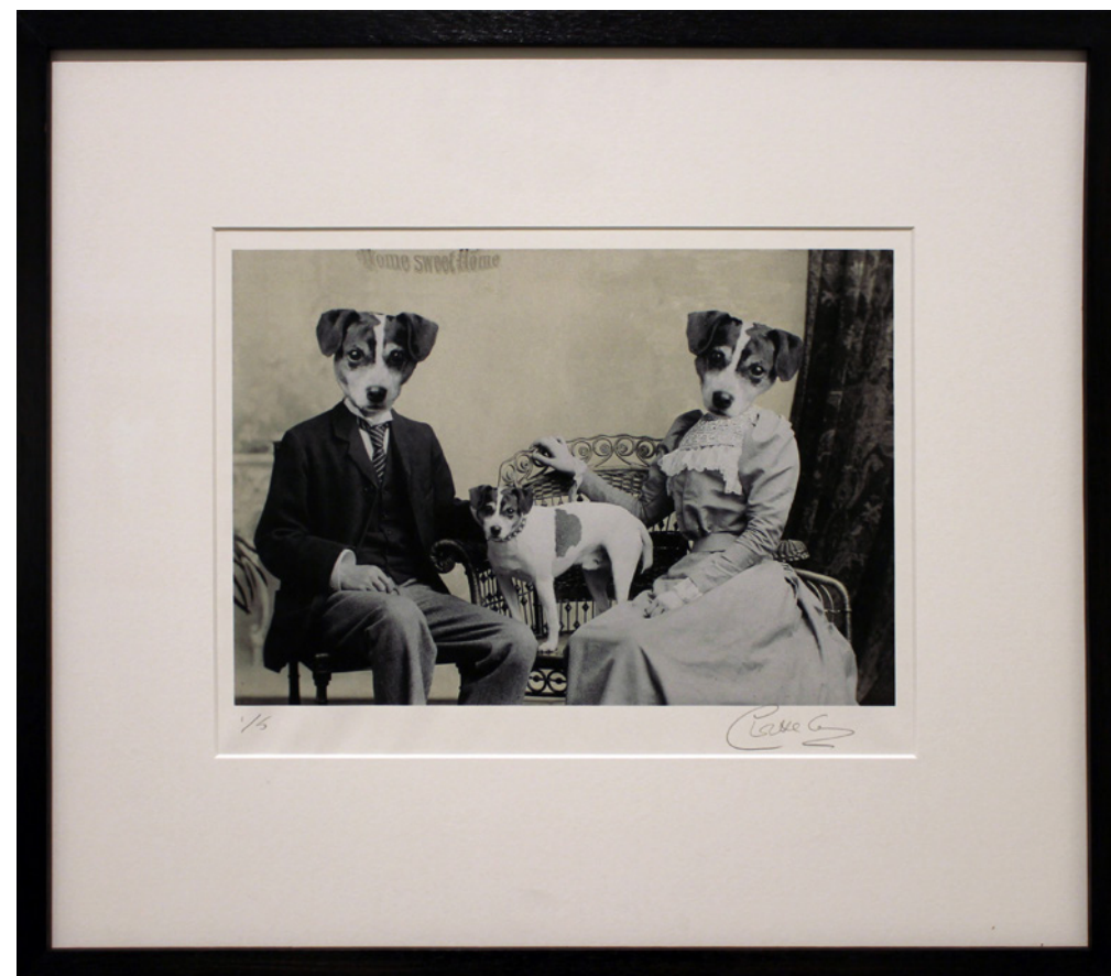
Charlotte Cory Little Sweetie 42 x 53cm Photomelange in black frame