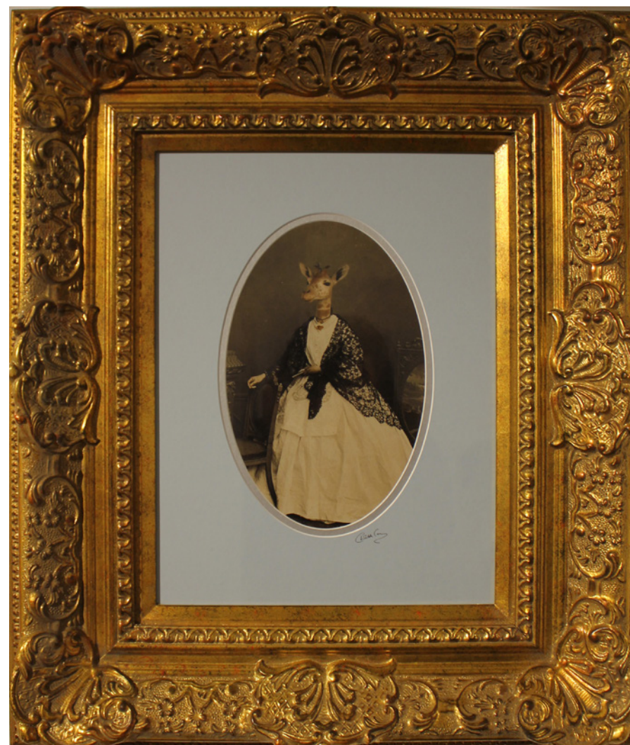
Charlotte Cory Her Best Shawl 54 x 64cm Photomontage in antique gold frame