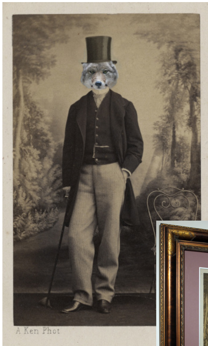
Charlotte Cory, Who are you looking at? 84 x 115cm, edition of 3, Photomelange with antique style bronzed frame