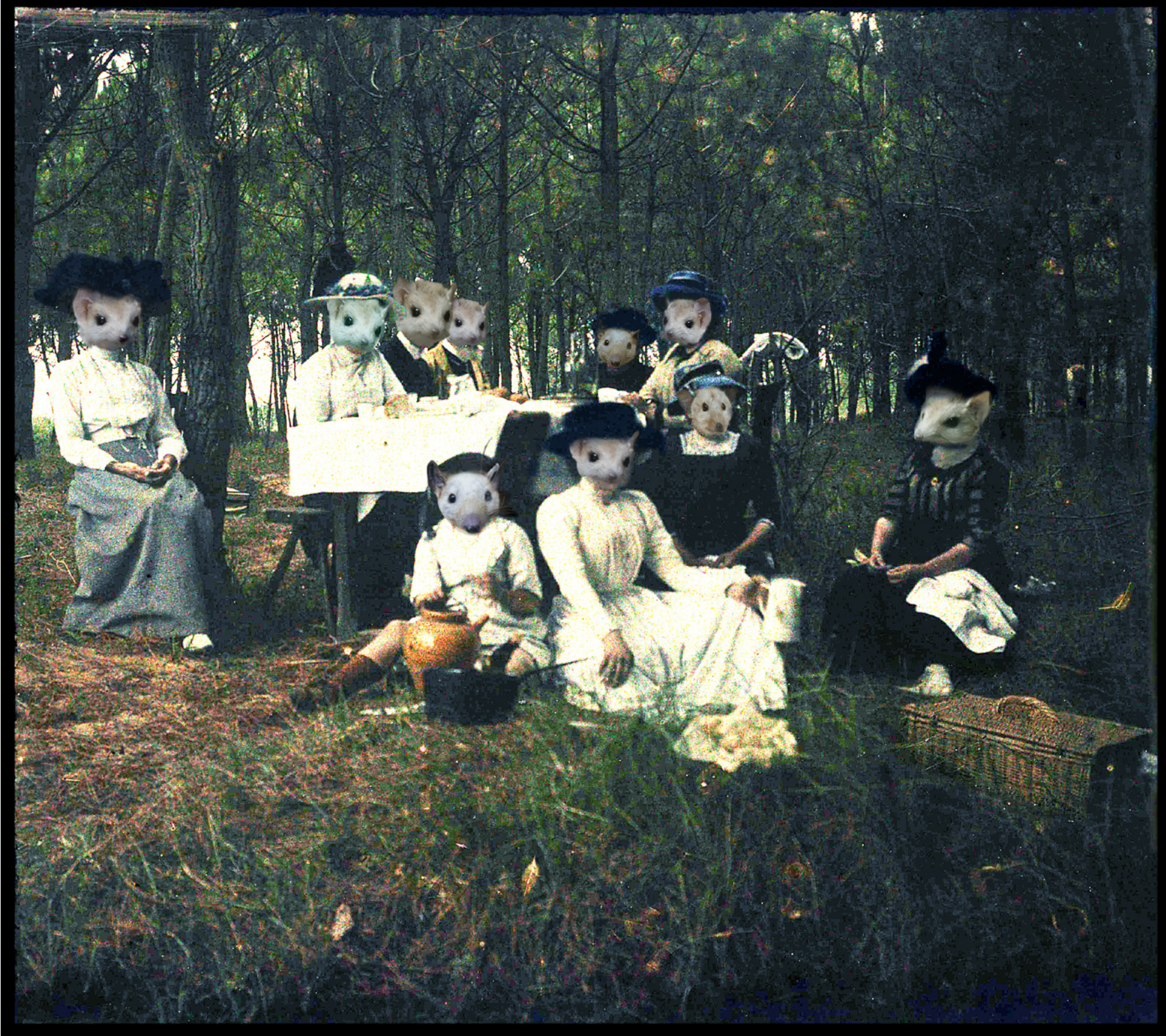
Charlotte Cory, Déjeuner sur l'herbe (apres Édouard Manet) 94 x 74cm Photomelange combining autochrome and original photography