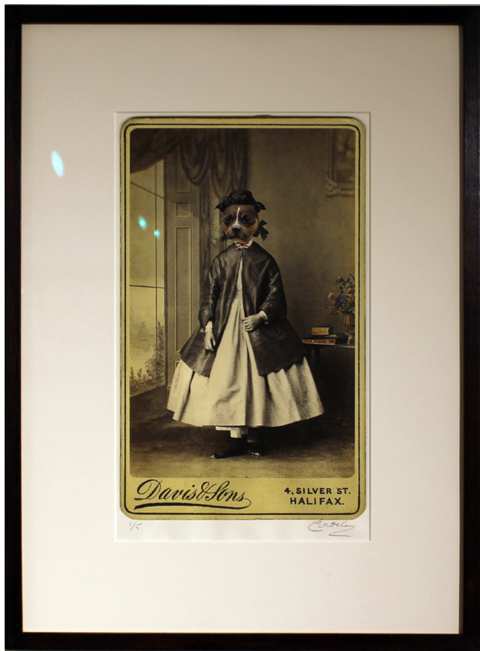
Charlotte Cory Bertha 43 x 58cm Photomelange in black frame