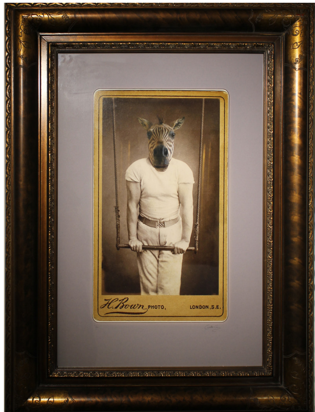
Charlotte Cory , The Gymnast 2, 74 x 98cm, edition of 3, Photomelange with antique style bronzed frame