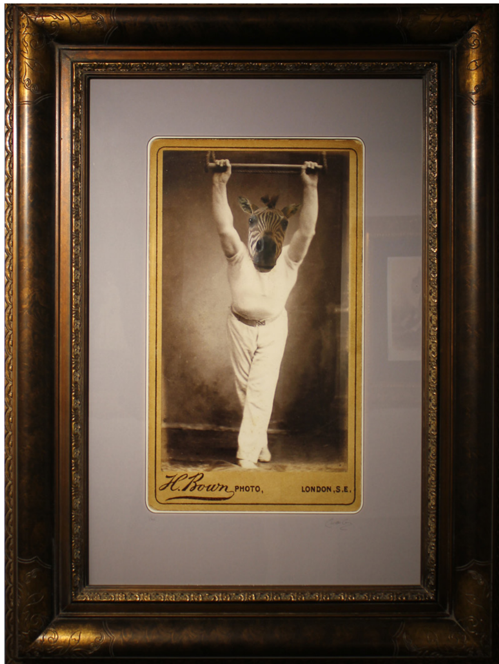
Charlotte Cory , The Gymnast 1, 74 x 98cm, edition of 3, Photomelange with antique style bronzed frame