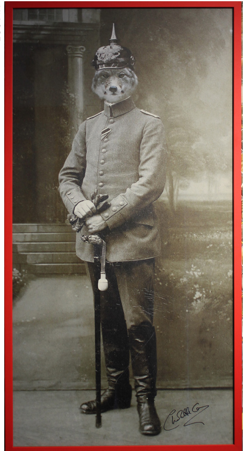
Charlotte Cory, Soldat 2 104 x 54 Unique piece Photomelange print on metal