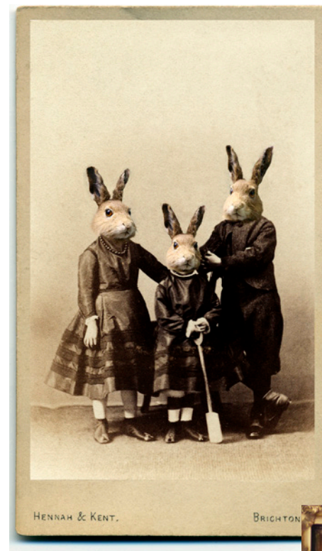
Charlotte Cory , 3 Brighton Rabbits 140 x 110cm (Last in edition) Photomelange with antique style bronzed frame w