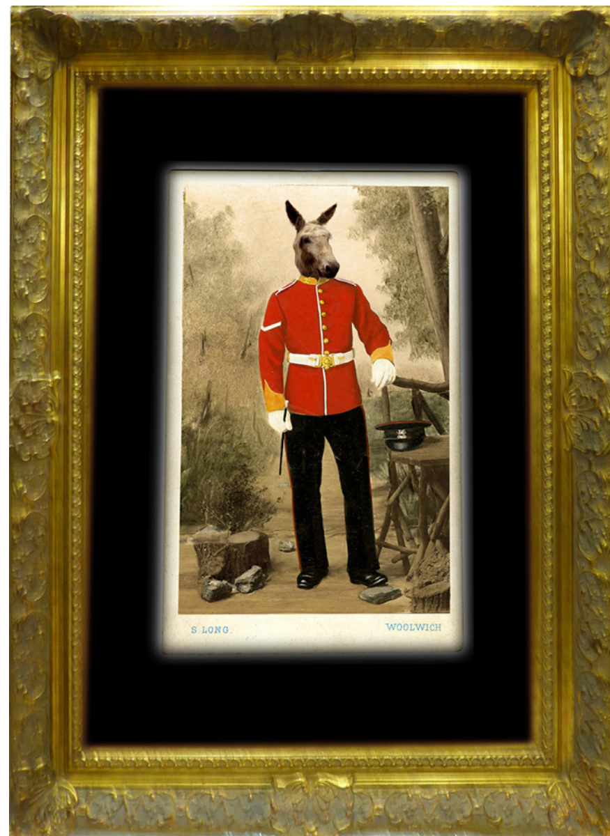
Charlotte Cory, The War Horse Photomontage in large gold frame 84 x 115cm (Opposite page - Artwork detail) This page - shows frame style)