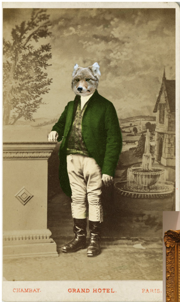
Charlotte Cory , Monsieur Le Wolf, 85 x 116cm edition of 3, Photomelange with antique style Gold frame