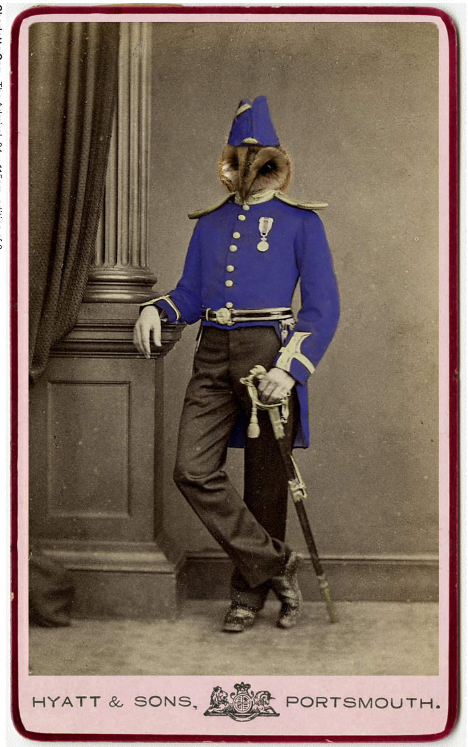
Charlotte Cory, The Admiral , 84 x 115cm, edition of 3, Photomelange with antique style bronzed frame (Artwork detail only - please contact the gallery for an image of the final framed piece)