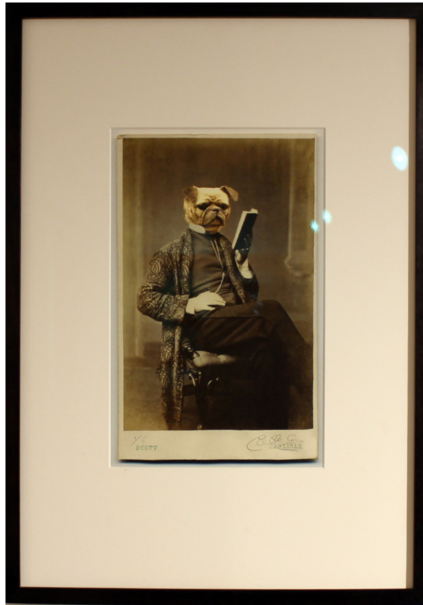
Charlotte Cory The Essayist 57 x 40cm Photomelange in black frame