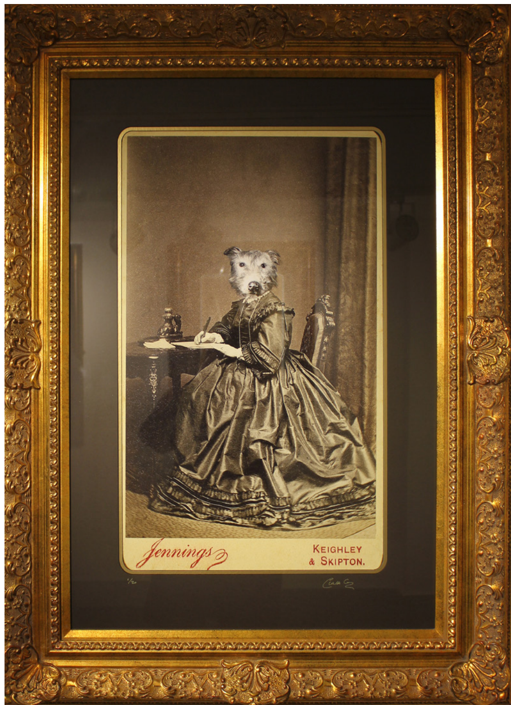
Charlotte Cory The Lady Novellist 84 x 115cm Photomontage in antique gold frame