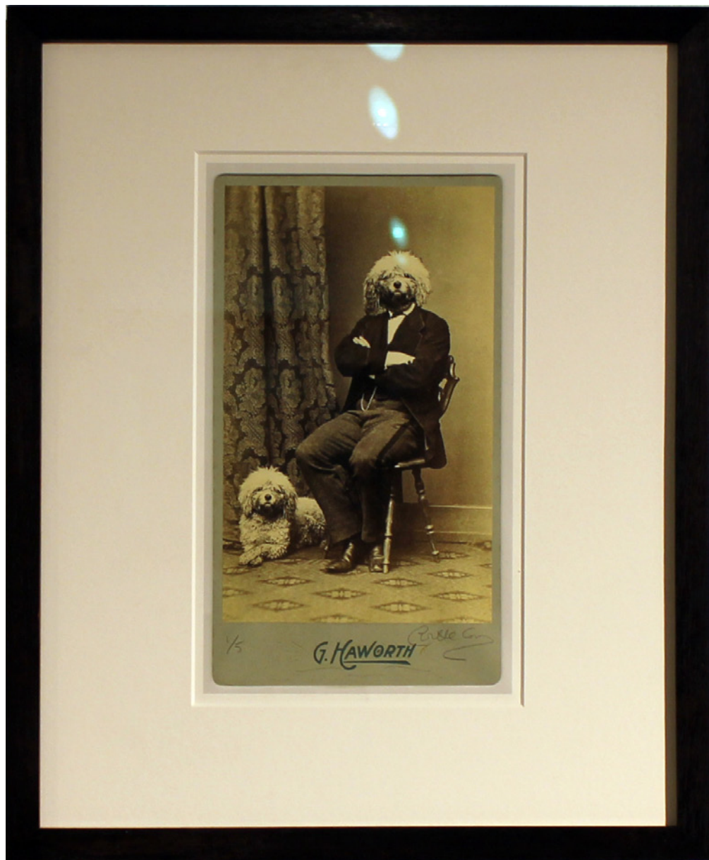
Charlotte Cory His Best Friend 32 x 39cm Photomelange in black frame